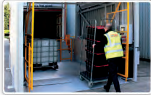
FIXED, SHALLOW LEAD-ON RAMP – SPEEDS UP LOADING AND MINIMISES MANUAL HANDLING