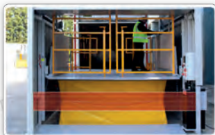
LIGHT-BEAM EXCLUSION ZONE