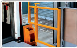
SURROUND SAFETY: FRONT MATERIAL GATES LOCK OUT TO PREVENT FALLS FROM BRIDGE PLATE