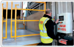
HMI TOUCHSCREEN CONTROLS – WITH RAPID-DIAGNOSTICS* PICTOGRAM AND LIVE PLANT STATUS OVERVIEW