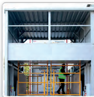
CLAD, ENCLOSED LOADHOUSE GIVES OPERATIVES A SHELTERED, WEATHERPROOF WORKING ENVIRONMENT