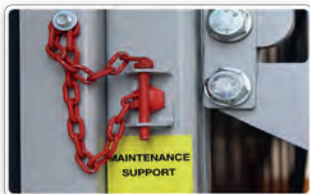
MAINTENANCE SAFETY PEGS: EASILY ACTIVATED FOR SAFE SERVICING