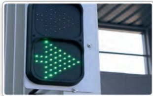
LED TRAFFIC LIGHTS: INTERLOCKED TO CONTROL PANEL (OPTIONAL)