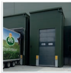
▲ Insulated Cladding To suit warehouse colour/style