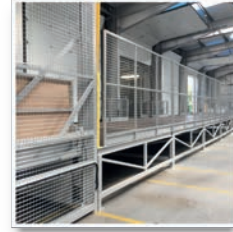
▲ Internal Dock Tables For faster un/loading – Dock Lifts move goods to ground