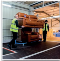
▲ Sound-Reduction Flooring Non-slip, hard-wearing