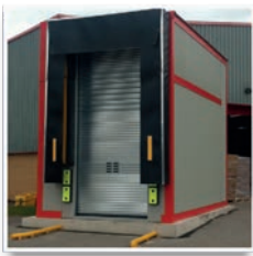
▲ Single-Skin Cladding To suit warehouse colour/style