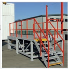
▲ Access Stairs Personnel access to/ from raised docks