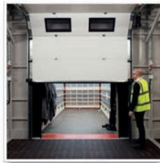
▲ Loading Bay Doors Options for roller shutter/ sectional