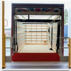
▲ Raised-Dock Extensions Straight run-through on/off vehicles