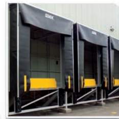
▲ Dock Levellers Bridge from docks to vehicle floor