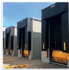
▲ V2G Yard Lifts Un/load from all vehicles to ground level