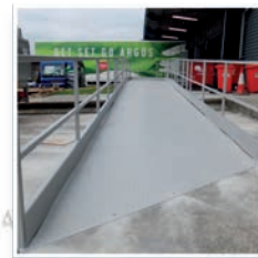
▲ Access Ramp To manually move products to/ from raised docks