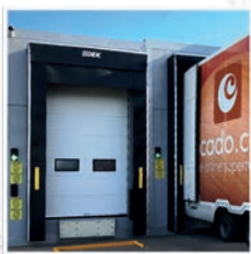
▲ Double Deck Lifts Un/load from raised docks to fixed double deckers