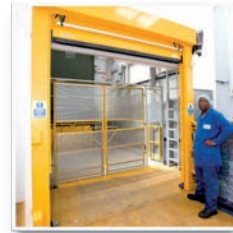
▲ Temperature-Controlled For chilled/ frozen operations