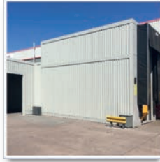
▲ Level-Access Extensions Typically with V2G Yard lift for un/loading