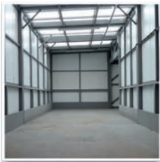
▲ Steel Durbar Flooring Heavy-duty operation